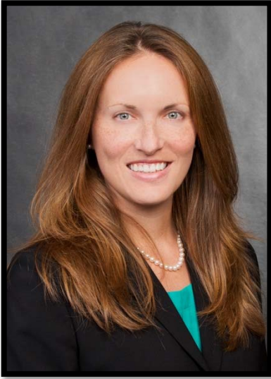
Deputy Head Office of Legal Counsel, Nuclear Energy Agency