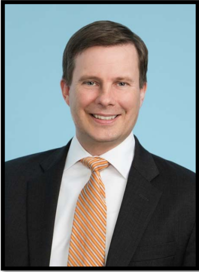
Partner Pillsbury Winthrop Shaw Pittman LLP