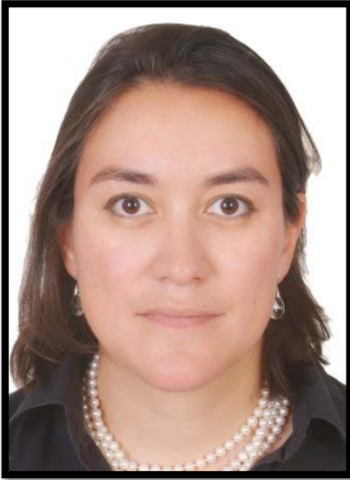
Head Office of Legal Counsel, Nuclear Energy Agency