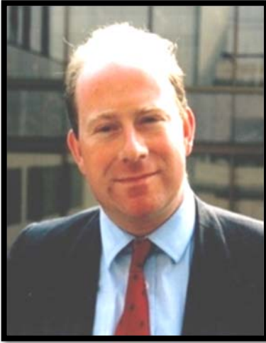
Former Managing Director Power Nuclear & Construction Division, Price Forbes & Partners Ltd