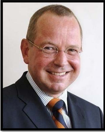
Section Head Nuclear and Treaty Law Section, Office of Legal Affairs, International Atomic Energy Agency (IAEA)