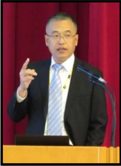
General Legal Counsel and Senior Engineer China Nuclear Power Engineering Co., Ltd