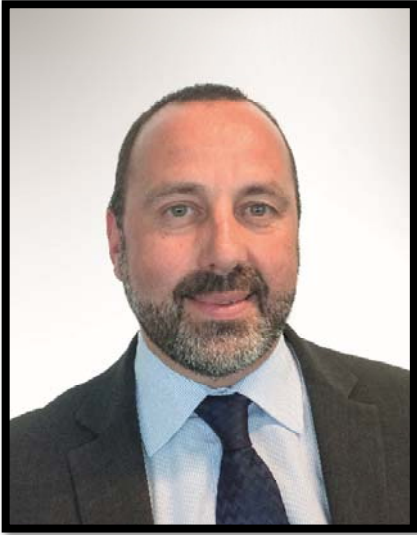
Head GIF and IFNEC Technical Secretariat, Deputy Head Division of Nuclear Technology Development and Economics, Nuclear Energy Agency