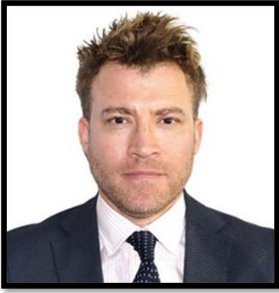
Legal Officer, Nuclear and Treaty Law Section, Office of Legal Affairs, International Atomic Energy Agency (IAEA)