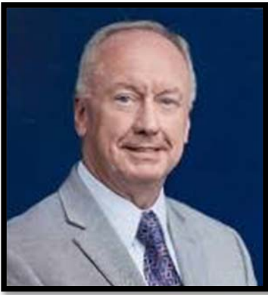
General Counsel and Board Secretary, Nawah Energy Company, PJSC