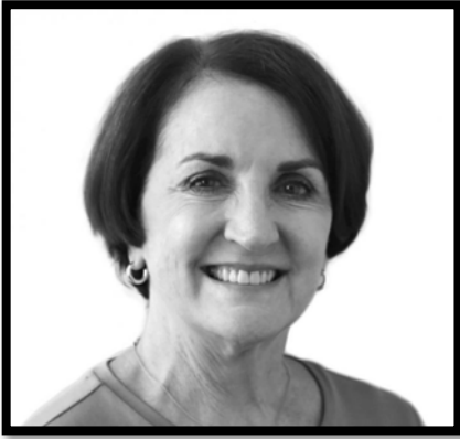
Director Open Nuclear Network