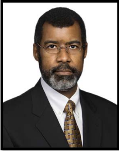
Director-General Nuclear Energy Agency