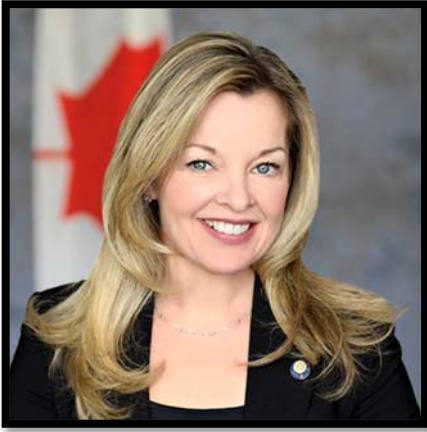
Senior General Counsel Canadian Nuclear Safety Commission