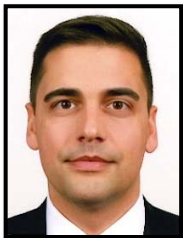
Group Senior Legal Counsel NKT