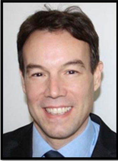
Legal Officer Non-Proliferation and Policy Making Section, Office of Legal Affairs, International Atomic Energy Agency (IAEA)