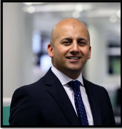
Head of Legal International Nuclear Services Ltd (INS)