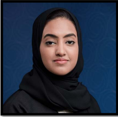
Deputy General Counsel, Nawah Energy Company (Nawah)