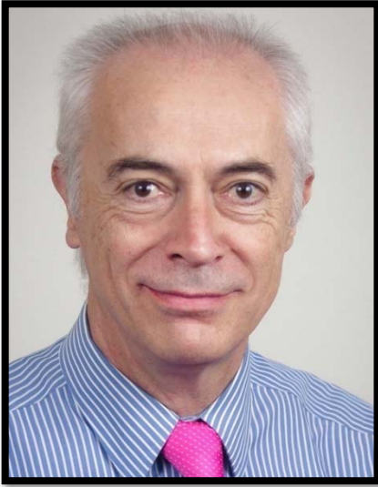
Former Director General FORATOM