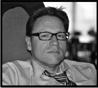
Head of Unit European Commission