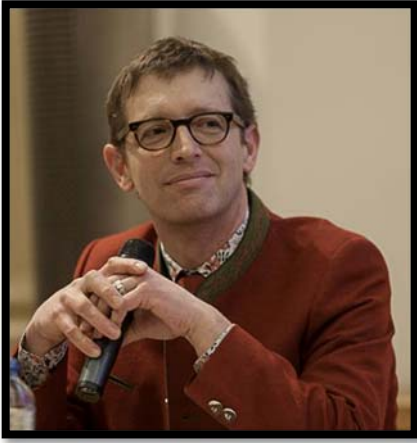
Professor University of Liege, Belgium