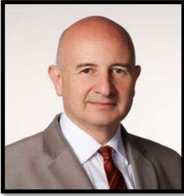
Austrian Ministry for Foreign Affairs